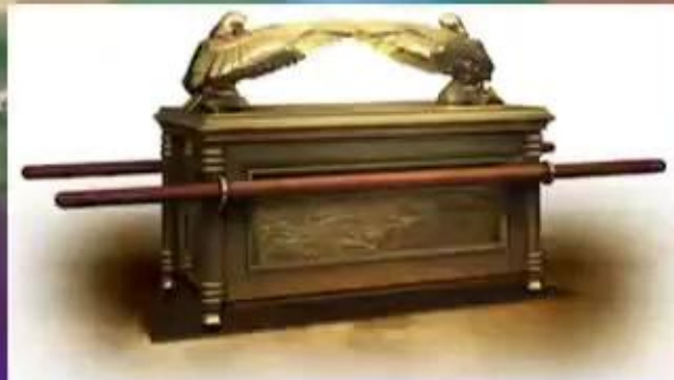
Ark of the Covenant